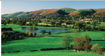
The Long Mynd and Church Stretton from Caer Caradoc