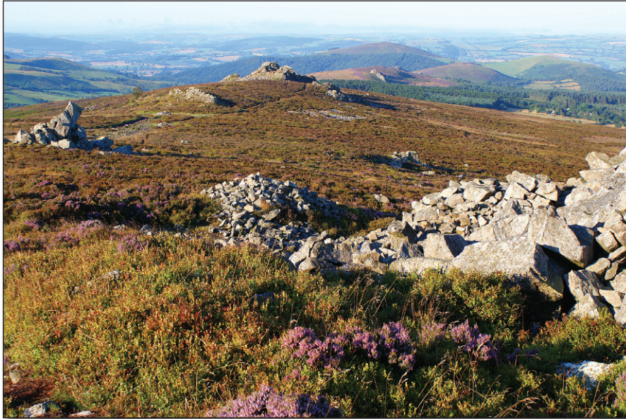
Looking South from Manstone Rock