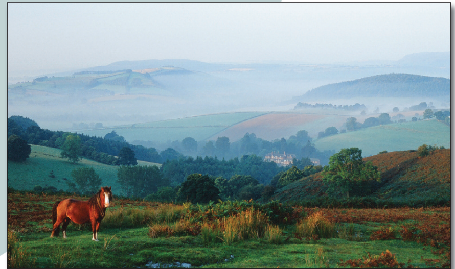
The Clun Hills and Valley