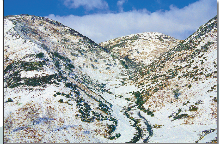
Carding Mill Valley in Winter.